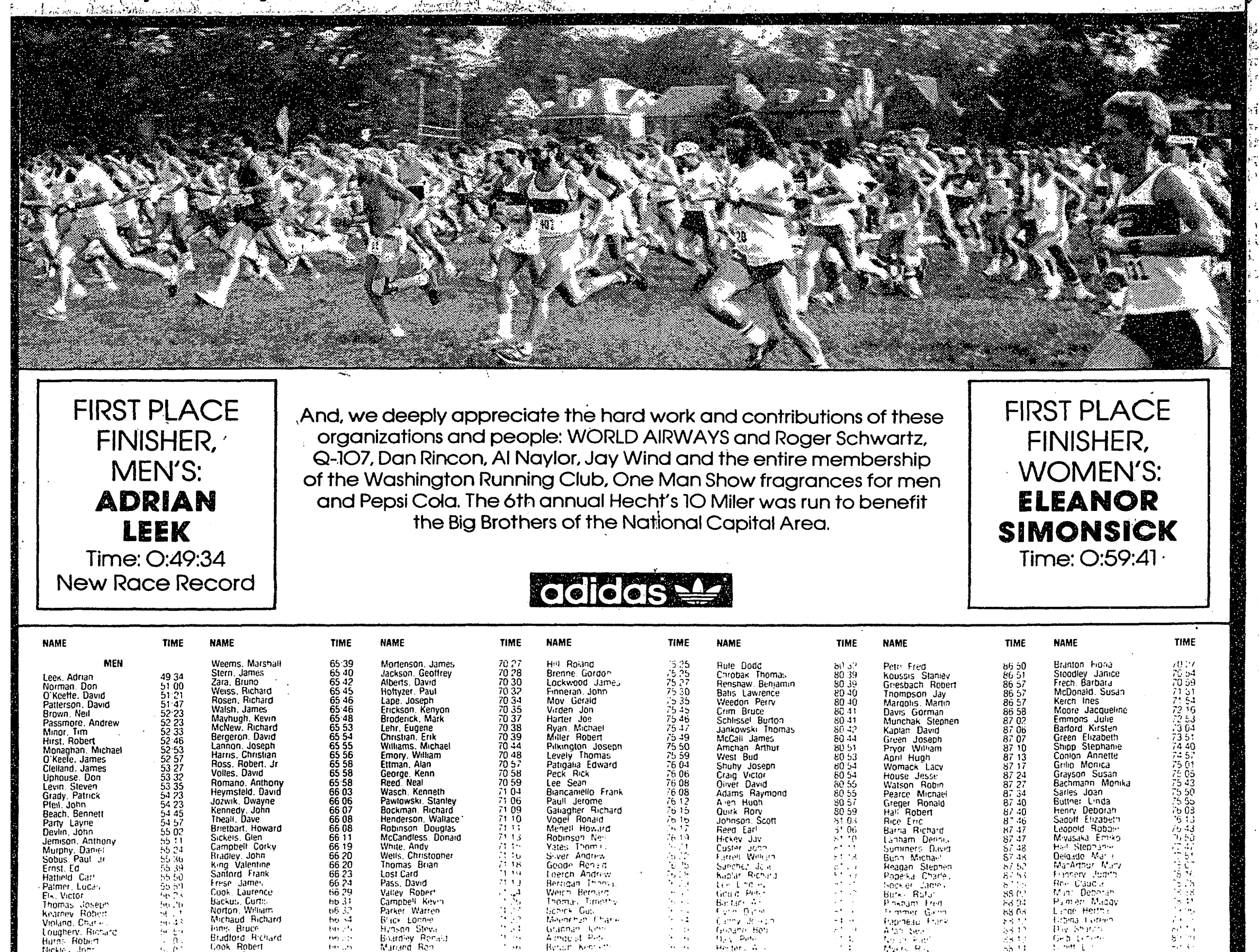
Here's to all 1090 stars of the 6th annual Hecht's 10 Miler, June 5, 1983. Special thanks to cosponsor adidas°